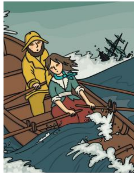
Grace Darling and her father