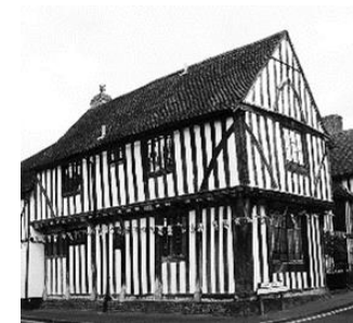
The Tudor house